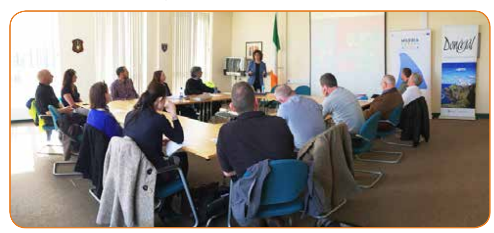
Participants in the WILDSEA Europe information session in Carndonagh 2016